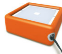
GO Shockproof cover for NiceWay transmitters