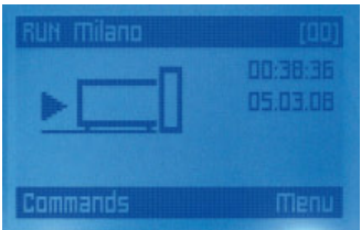
O-View programmer display