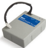
PS124 24 V battery with integrated battery charger.