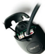
OX2 Pre-wired receiver card for control of Garage doors and external devices