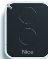
ON2E Transmitter 433.92 MHz 2 channel