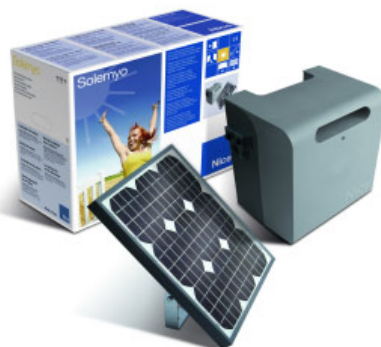
Solemyo solar kit

The innovative Opera system enables the installer to manage, program and control automation systems, also remotely, simply and safely, with significant savings in time.