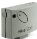
OXI Plug-in receiver