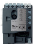
RBA3 Spare control unit