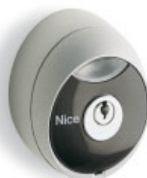
MOSE Key selector switch for outdoor installation