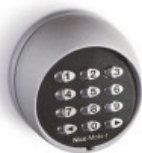
MOTXR Wireless keypad